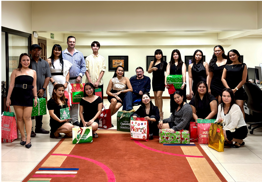
Exchange gifts in the afternoon... goes in pair with much games and happiness.