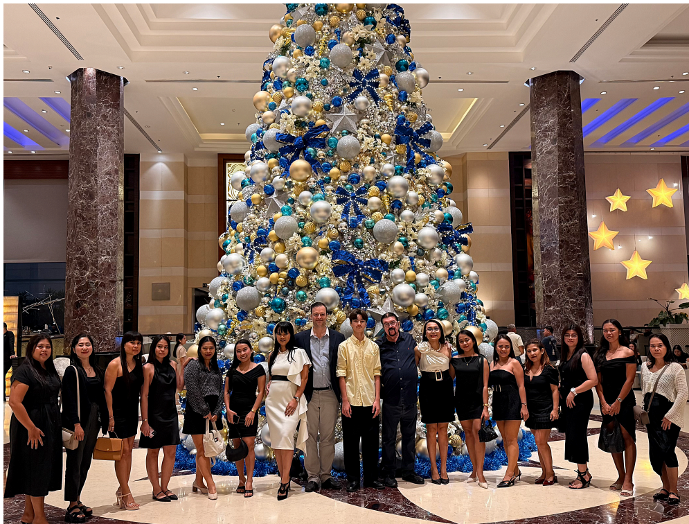
In the Radisson Blu they have a famous gigantic Christmas tree in one of the many corners of the entrance hall and also special stairs, suitable for "picture picture", one of the great pleasures for Philippine people in particular.